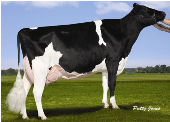
COMESTAR GOLDWYN LILAC FOURTH DAM