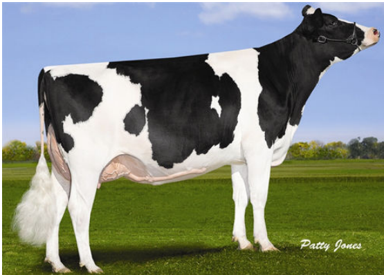
MAPEL WOOD M O M LUCY THIRD DAM