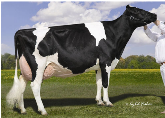
LYLEHAVEN LILA Z FIFTH DAM