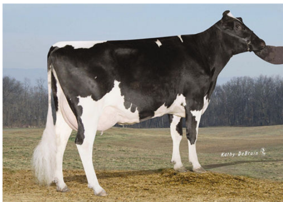
PINE-TREE MONICA SUELA FIFTH DAM