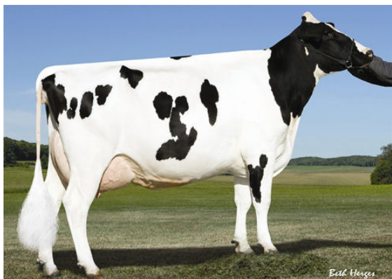
PINE-TREE MONICA PLANETA FOURTH DAM