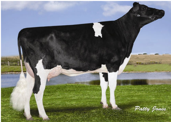
MORMANN SR GINGERBRED THIRD DAM