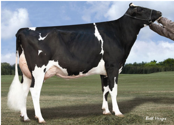
REGANCREST MAC BRESHAN FIFTH DAM