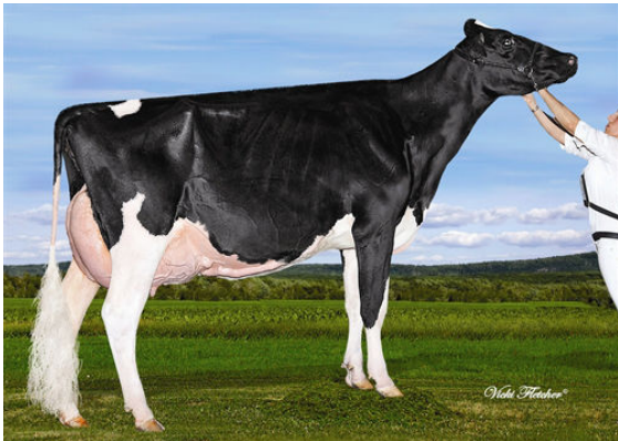
MS PRIDE GOLD INVITE 761 FOURTH DAM