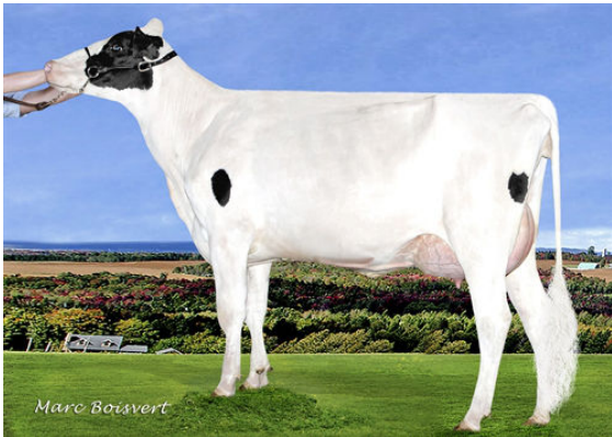
DUDOC MAGNA REQUIEM P FOURTH DAM