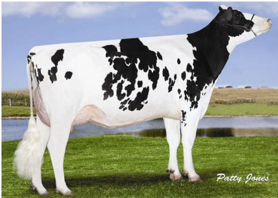
RUSSELLWAY CAMERON PINKY FOURTH DAM