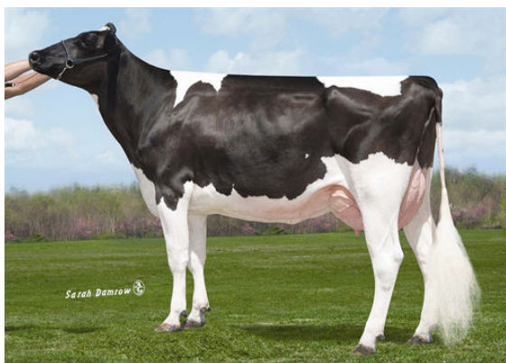
SULLY PLANET MANITOBA FIFTH DAM