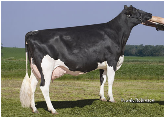
RI-VAL-RE GOLDWYN NADINE FIFTH DAM