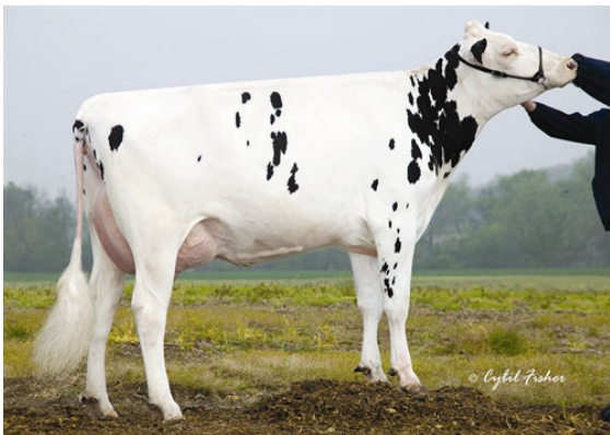
ART-ACRES KAY721 FIFTH DAM