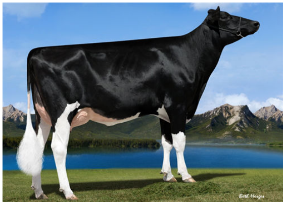
MS HUE TANGO 57644 GRANDDAM