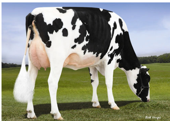
LOOKOUT PESCE EPIC HUE THIRD DAM