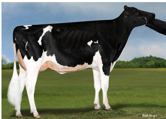
PROGENESIS OCTOBERFEST HANNAH DAM