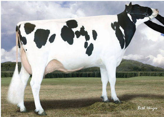
SCHILLVIEW SHOTTLE GOLDY FIFTH DAM