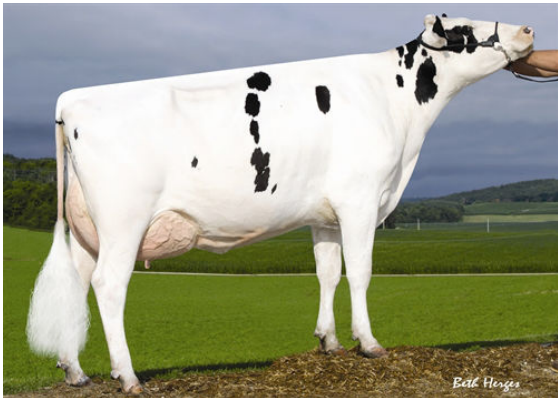
SCHILLVIEW PLANET GOBEA FOURTH DAM