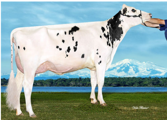
WESTCOAST ABURN BDUST 4061 DAM