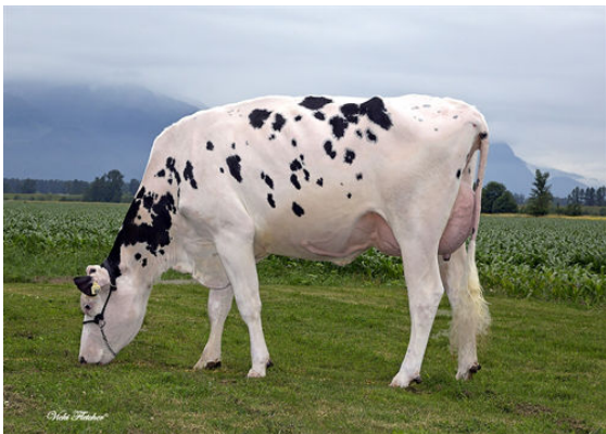
WESTCOAST ABURN BDUST 4061 DAM