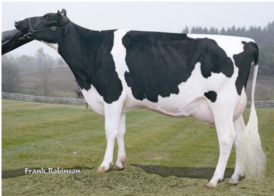
HOL-STAR OUTSIDE TERE E FOURTH DAM