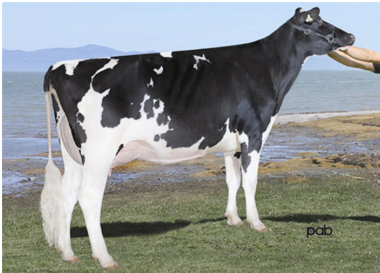
WABASH-WAY-I SHOTTLE EMBER FOURTH DAM