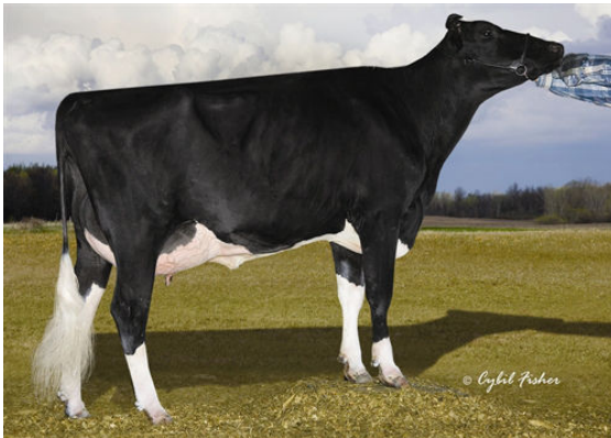
PENYA FIFTH DAM