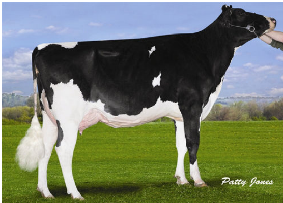
MS LOOKOUT PESK BKM BRIA THIRD DAM