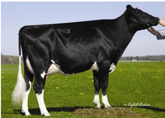
REGANCREST BRYNNA THIRD DAM