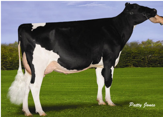
SANDY-VALLEY ATWD BRADY GRANDDAM