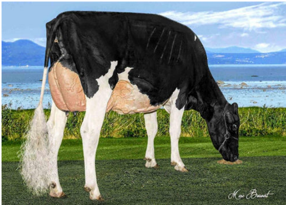
DULET PITBULL ASHLEY DAM