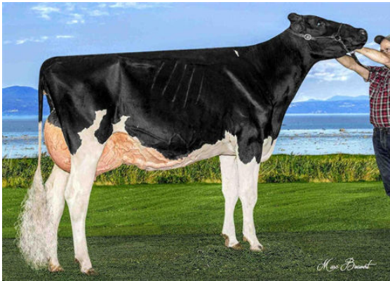
DULET PITBULL ASHLEY DAM