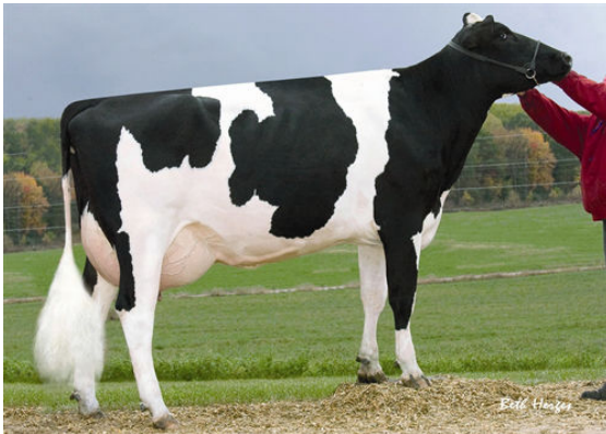
SANDY-VALLEY BOLT SHEILA FIFTH DAM