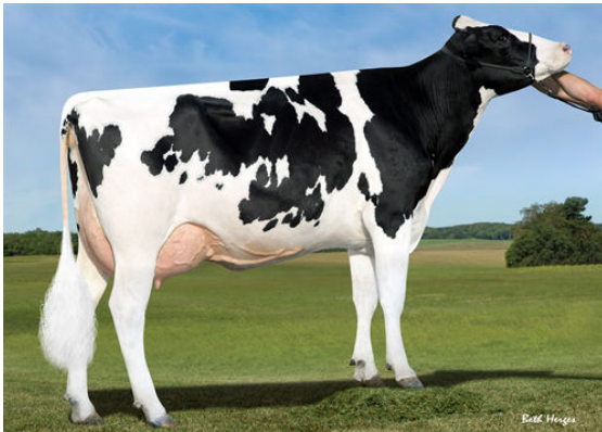
SANDY-VALLEY MORGAN ERA GRANDDAM