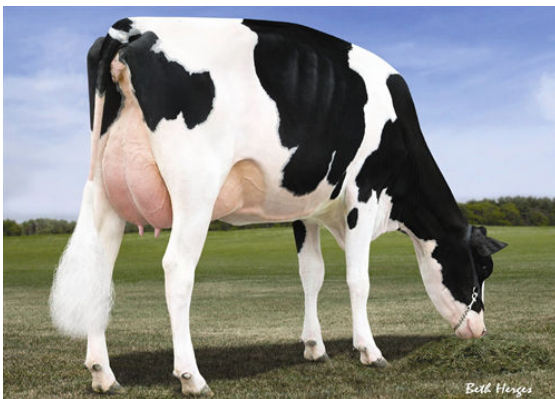
MORSAN MAN D MISSY THIRD DAM