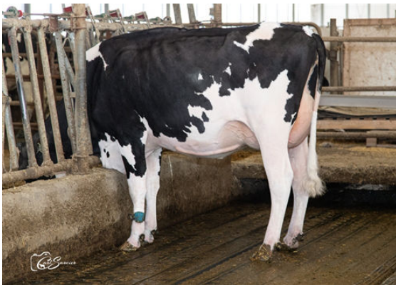
PELLERAT WEBSTER P DECCOX DAUGHTER