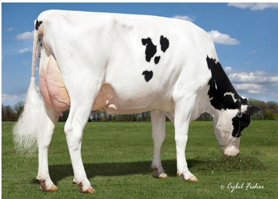
SANDY-VALLEY UNO PAXTON GRANDDAM