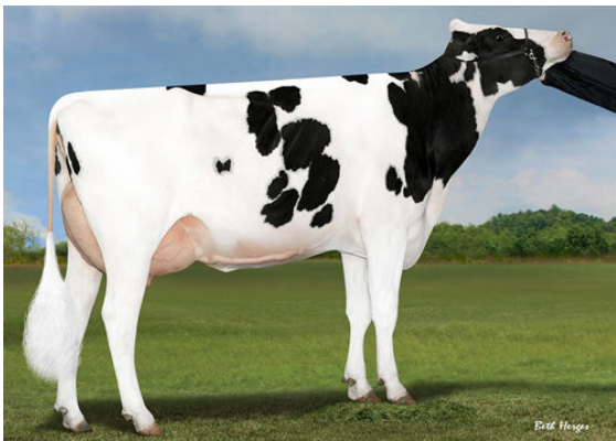
PEAK PAXTON SPRING 60034 DAM