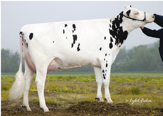
ART-ACRES KAY721 FOURTH DAM