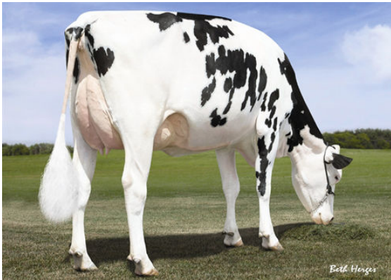
MS C-HAVEN OMAN KOOL THIRD DAM