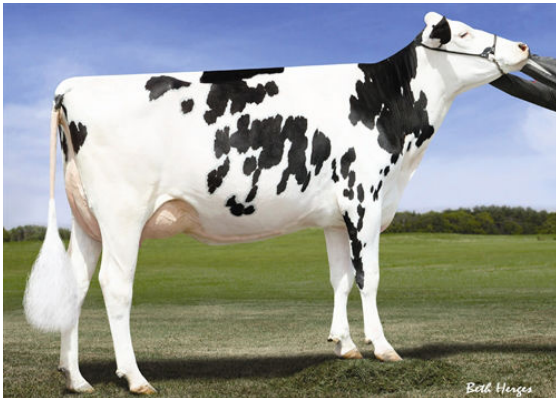
MS C-HAVEN OMAN KOOL THIRD DAM