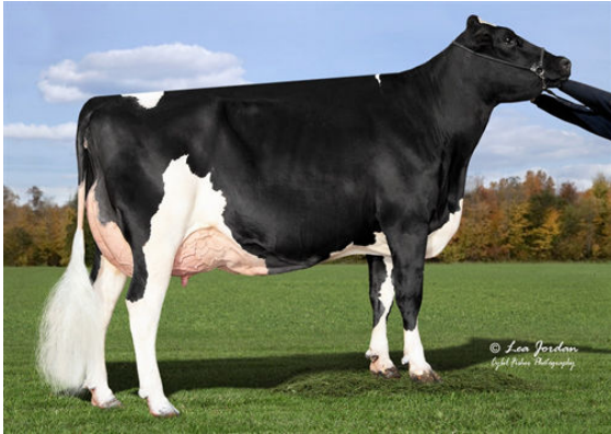
AOT FABULOUS HENLEY DAUGHTER