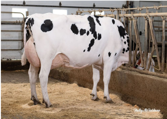
PROGENESIS FABULOUS DAIQUIRI DAUGHTER