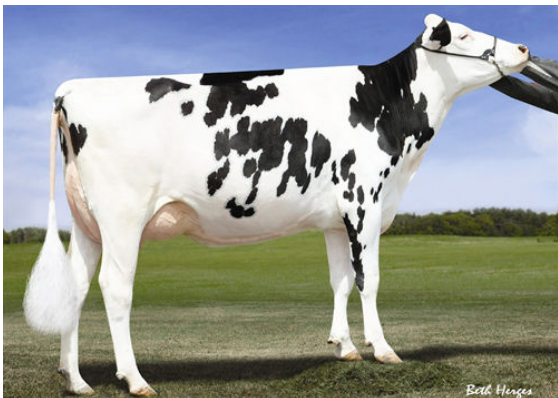
MS C-HAVEN OMAN KOOL THIRD DAM