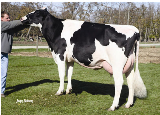
CROCKETT-ACRES ELITA FOURTH DAM