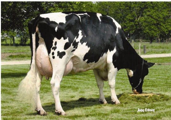
CROCKETT-ACRES MTOT ELLY FIFTH DAM