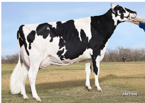
MORNINGVIEW BAXTER D-RAE THIRD DAM