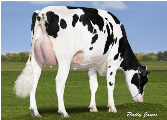
SNOWBIZ MCCUTCHEN LOTTIE DAM