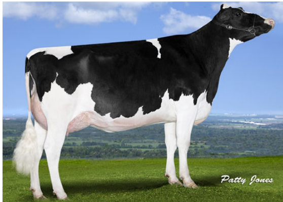
GIL-GAR PREDES MERLOT DAM