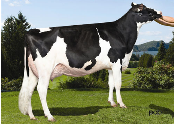
LES091 BAXTER MODEL RUBIS