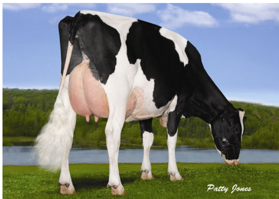
SANDY-VALLEY PLANET MELODY