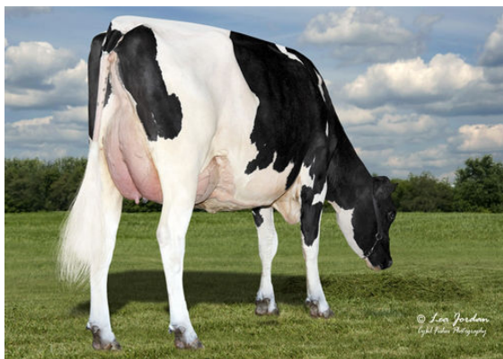
EL-NA MYSPACE 6457