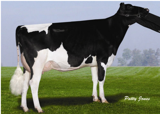
WHITTIER-FARMS HE REBECA FIFTH DAM