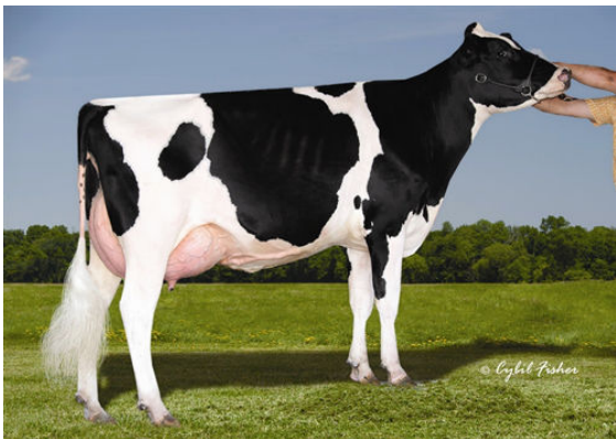
CHERRY CREST MANOMAN ROZ FOURTH DAM