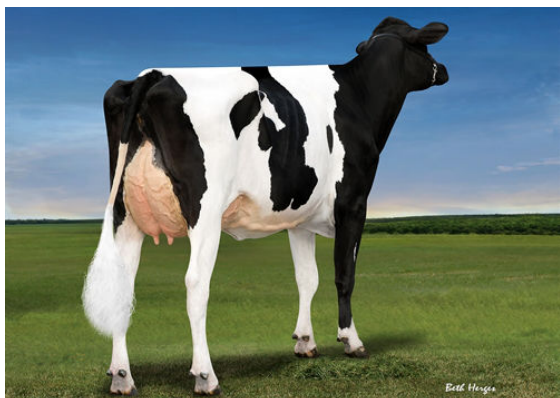
OH-RIVER-SYC MOGAL BRYLAN