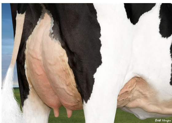
OH-RIVER-SYC MOGAL BRYLAN