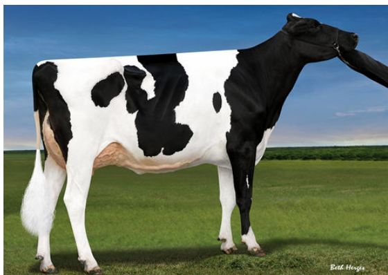
OH-RIVER-SYC MOGAL BRYLAN