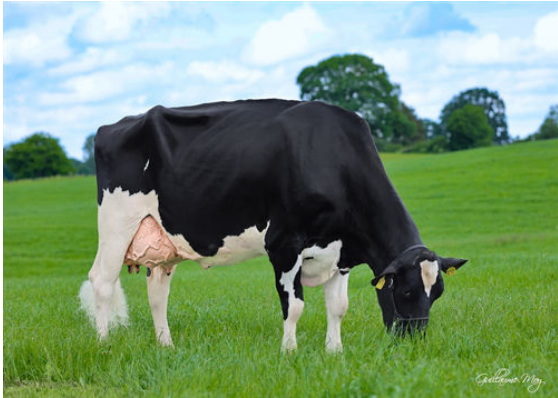
HAH IWANKA DAM