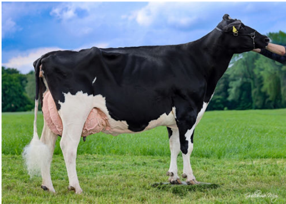
HAH IWANKA DAM