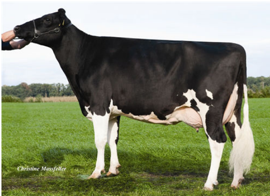
KAIRO FIFTH DAM