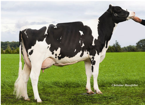
KANU FOURTH DAM