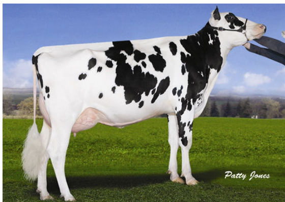
GILLETTE BOLTON 2ND LOOK FIFTH DAM