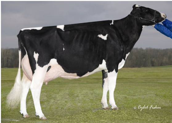
BUDJON-JK DUR ESQUISITE FIFTH DAM