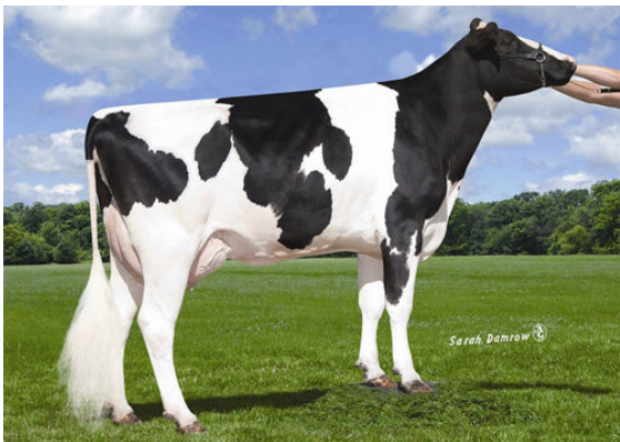
BLUE-HORIZON PLAN EDITH THIRD DAM