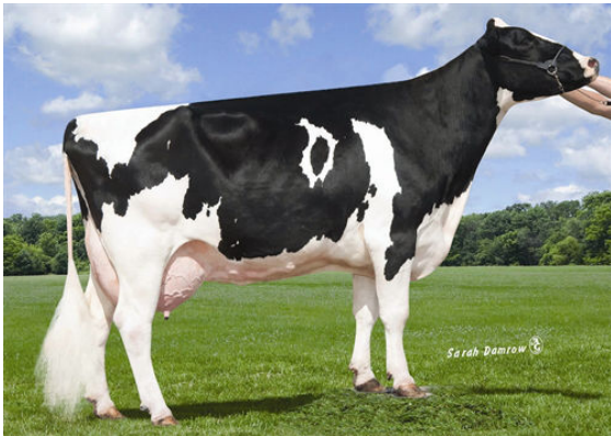
ROLLING-SPRING M ECLIPSE FOURTH DAM