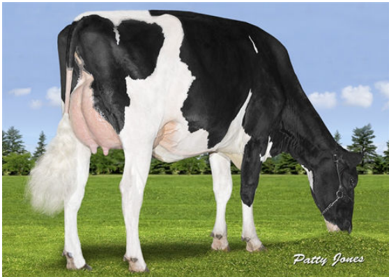
WALNUTLAWN ABBOTT BREEZE