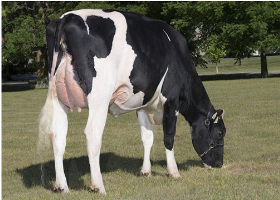
WALNUTLAWN ABBOTT BREEZE