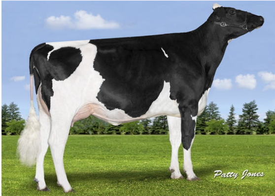
WALNUTLAWN ABBOTT BREEZE