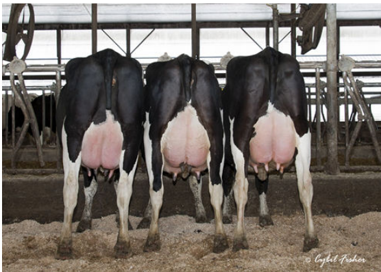
SUPERMAN DAUGHTER GROUP

L-R CURTIN SUPERMAN 20220, CURTIN SUPERMAN 20048, CURTIN SUPERMAN 20219