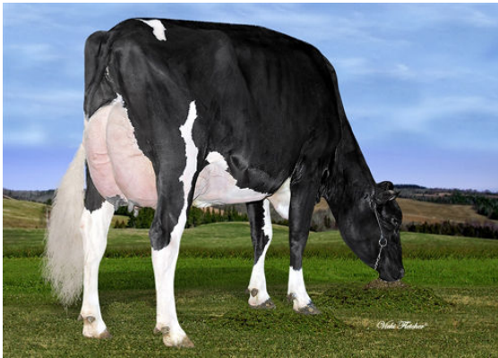
LINDENRIGHT SUPERMAN MOOLA