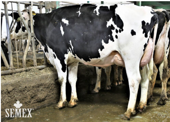
BERNI SUPERMAN DIVA