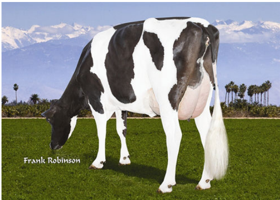
AIR-OSA HALAK 15325