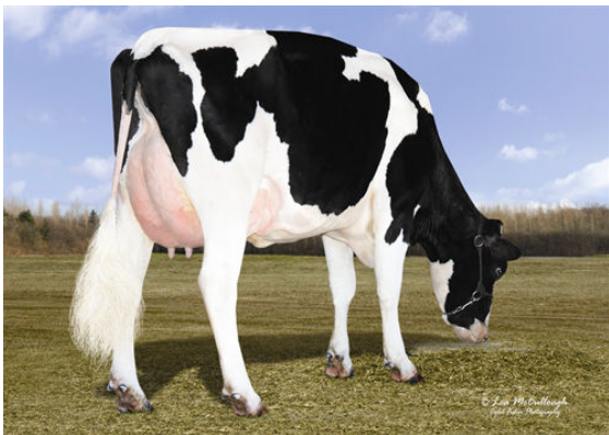
CHRIS-DA HALAK 420