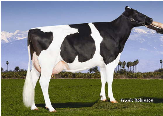
AIR-OSA HALAK 15389