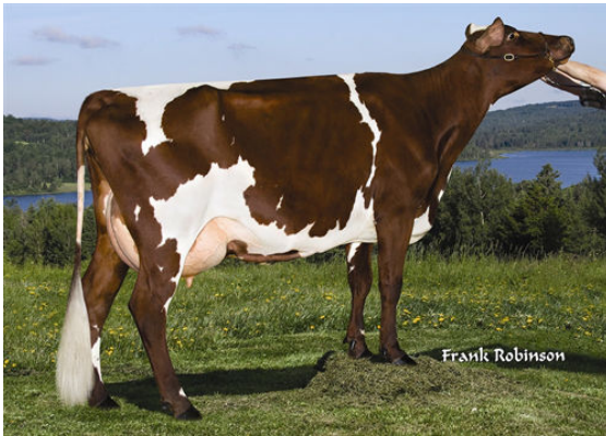
KAMOURASKA POKER RUBIS GRANDDAM