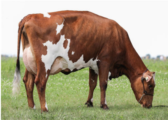
LAGACE RAFTING BIANNA