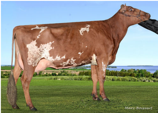
DUO STAR AMICALE DAM