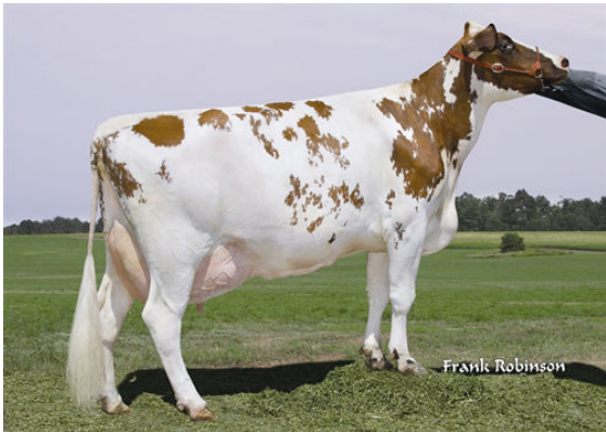
KELLCREST FENELLA Dam