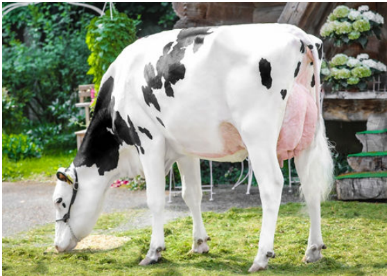
CLAYNOOK LUSTER CYNAR SG DAM