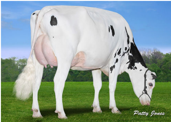
CLAYNOOK CLARISSA SPRING GRANDDAM