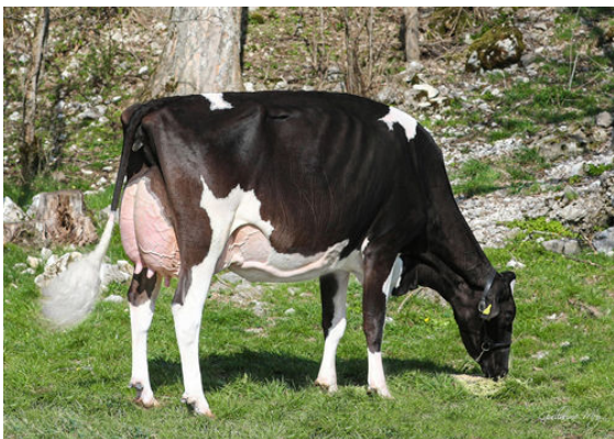
PTIT COEUR UNIX DARLINGA