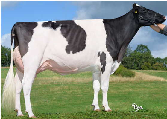
PTIT COEUR SIDEKICK DANCING