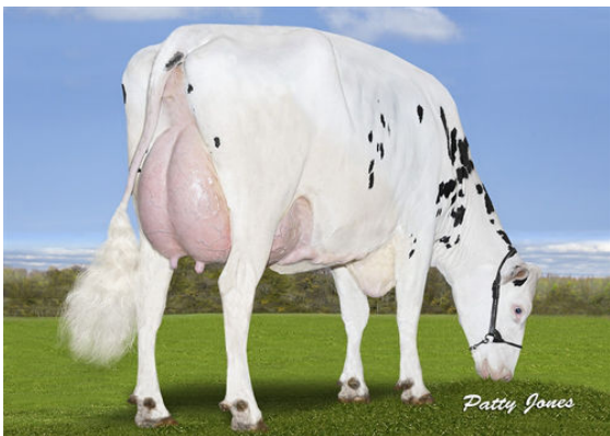
CALBRETT KINGBOY MIRANDA P THIRD DAM