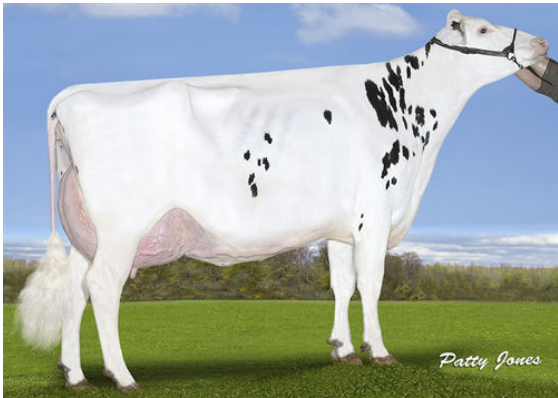
CALBRETT KINGBOY MIRANDA P THIRD DAM