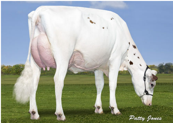
SNOWBIZ LADD P MARSHMELLOW FOURTH DAM