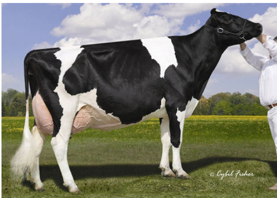
LYLEHAVEN LILA Z FIFTH DAM