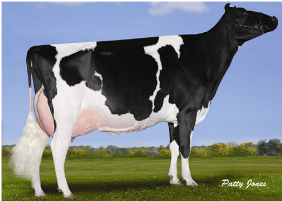
CALBRETT GOLDWYN LAYLA FOURTH DAM