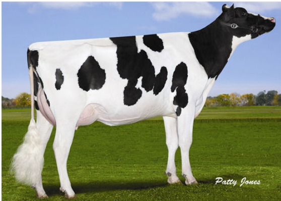
CALBRETT SNOWMAN LEXIE THIRD DAM