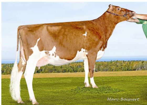
PLEIN SOLEIL HEYDA